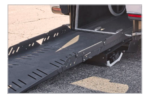
Verge<sup>™</sup> II E Low cost, manual, rear entry, fold-out ramp.